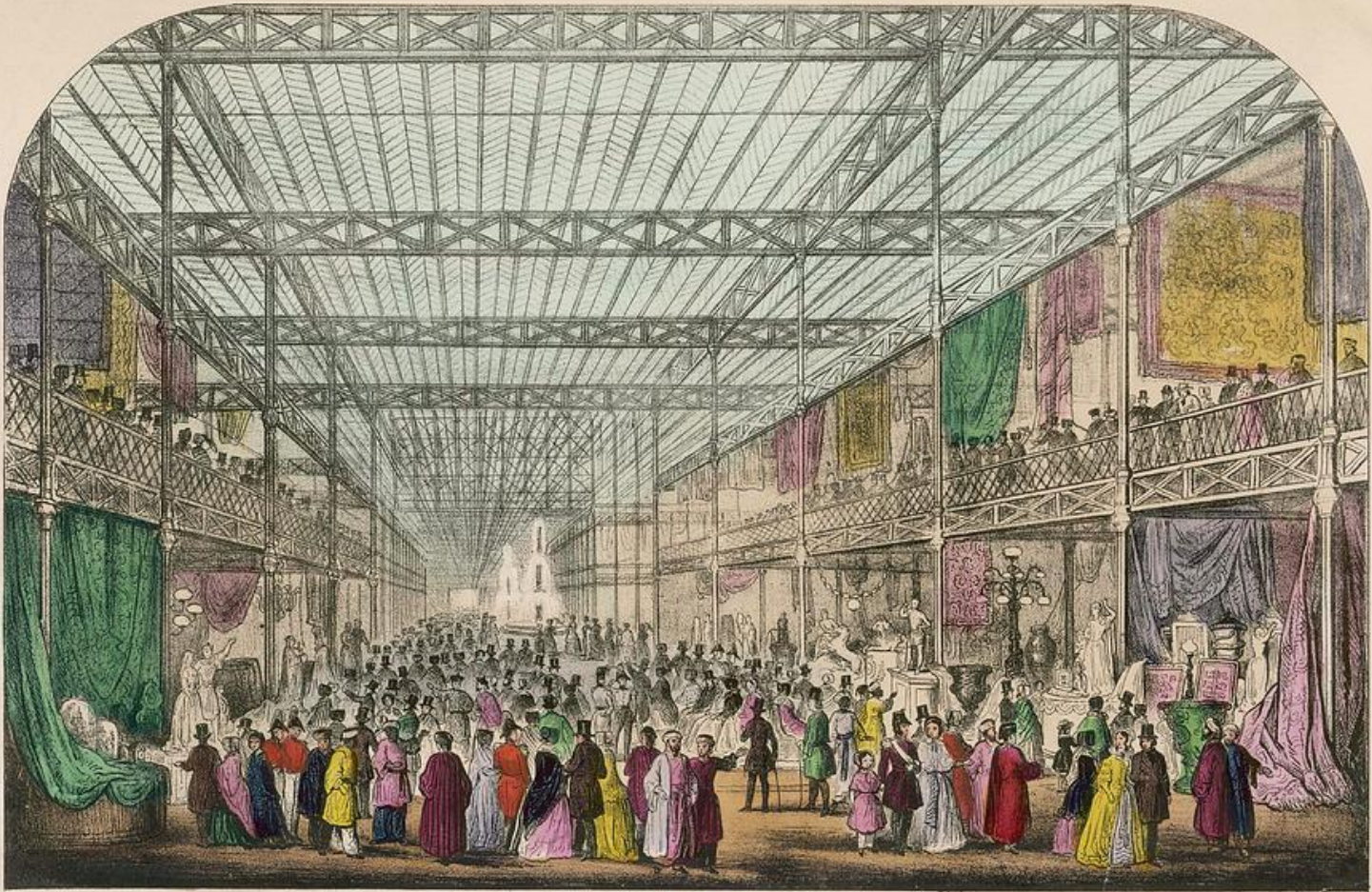
INTERIOR OF THE GREAT EXHIBITION OF ALL NATIONS.